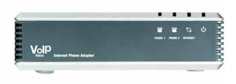
Figure 2-2: Front Panel

The Phone Adapter's LEDs, which inform you about network activities, are located on the front panel.