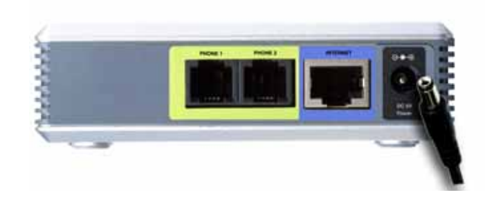
Figure 3-4: Connect the Power Adapter