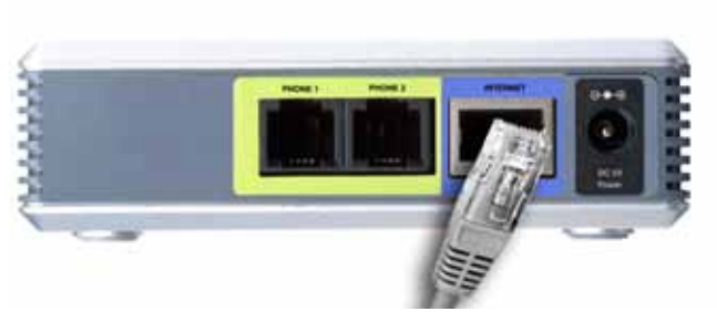
Figure 3-3: Connect the Ethernet Network Cable

The installation of the Phone Adapter is complete. Now you can pick up your phone and make calls.