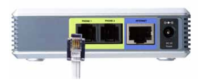
Figure 3-2: Connect the RJ-11 Telephone Cable

IMPORTANT: Do not connect either of the Phone ports to a telephone wall jack. Make sure you only connect a telephone or fax machine to either of the Phone ports. Otherwise, the Phone Adapter or the telephone wiring in your home or office may be damaged.