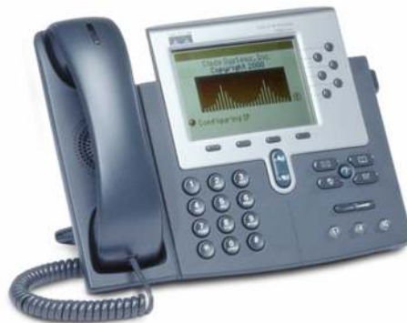
Figure 1. Cisco IP Phone 7960G

The Cisco IP Phone 7960G, a key offering in the IP Phone portfolio, is a full-featured IP phone primarily for manager and executive needs. It provides six programmable line/feature buttons and four interactive soft keys that guide a user through call features and functions. Audio controls for duplex speakerphone, handset and headset. The Cisco IP Phone 7960G also features a large, pixel-based LCD display. The display provides features such as date and time, calling party name, calling party number, and digits dialed. The graphic capability of the display allows for the inclusion of such features as XML (Extensible Markup Language) and future features.